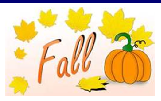
HAPPY FALL EVERYONE !!!

The nominating committee would like to say "thank you" to all of you who ran for office this year. We really appreciate you stepping up and taking an active part in your association. Also, those of you that told me you may run next year, I will be looking for your name on the ballot next year!